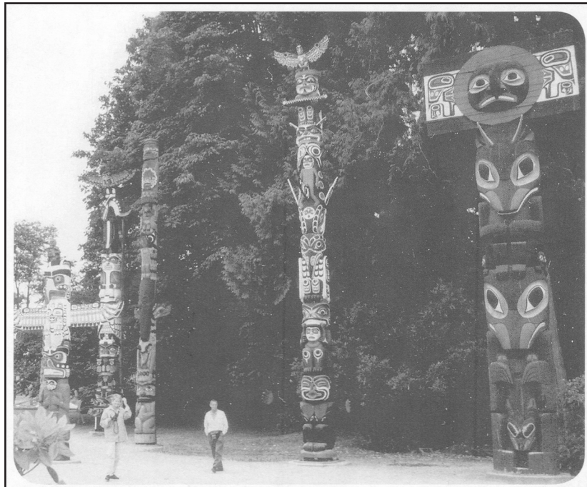
People stand among a group of Tlingit totem poles.

Storytelling Trees by Micki Huysken from Hopscotch Magazine, October/November 2010.