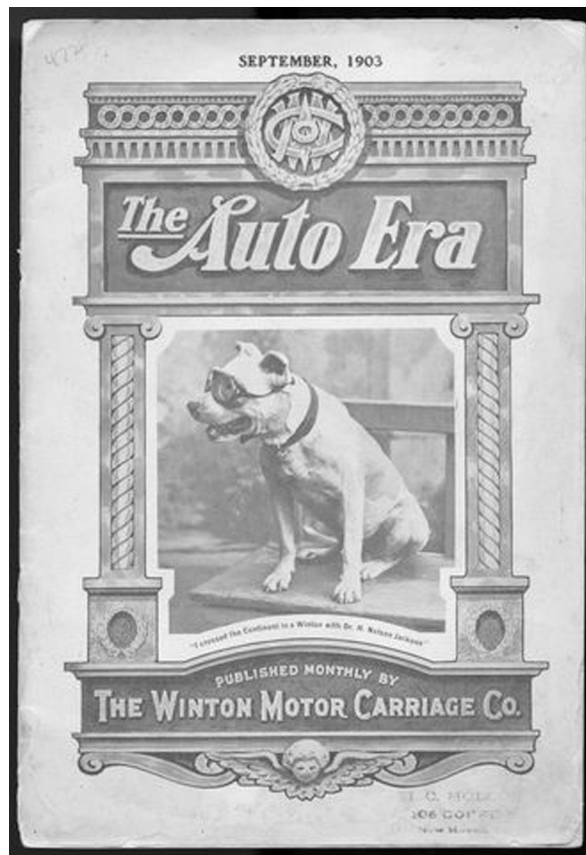
Transportation Collection, Division of Work and Industry, National Museum of American History, Smithsonian Institution.