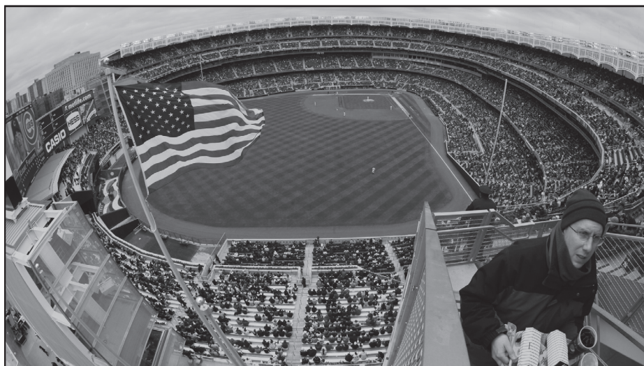
New Yankee Stadium on Opening Day, April 16, 2009